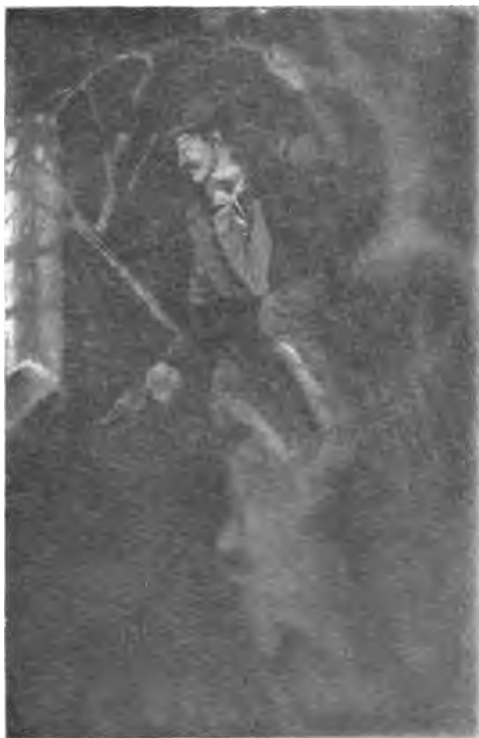
Back saw in a shadowed gesture